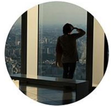
Corporate Citizenship & Philanthropy