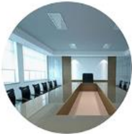
Environmental, Social & Governance