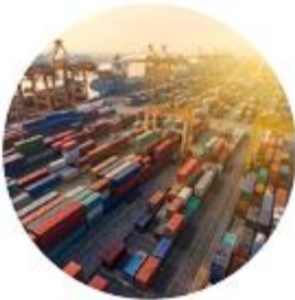
Economy, Strategy & Finance