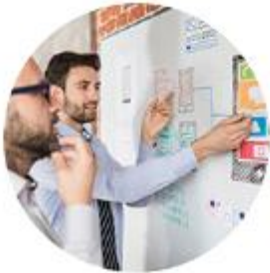
Marketing & Communications