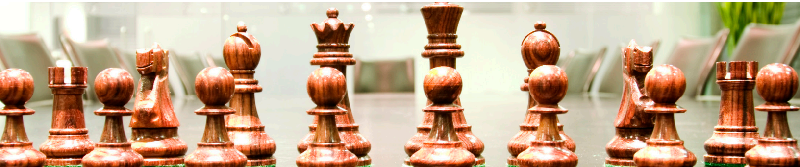
Chart of the Week