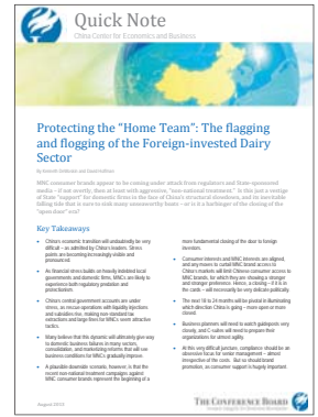
China Quick Notes