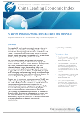
China Leading Economic Index