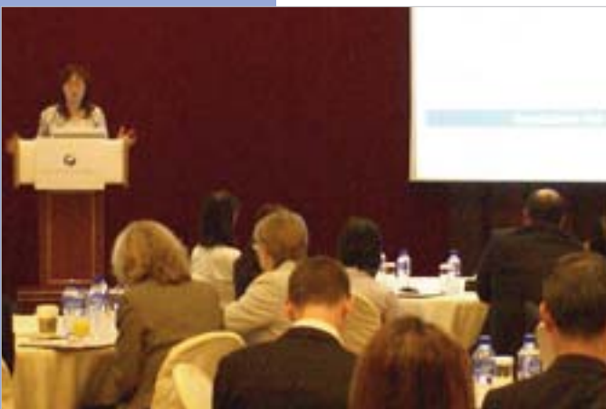
One session at Asia-Pacific Human Resources Week 2008