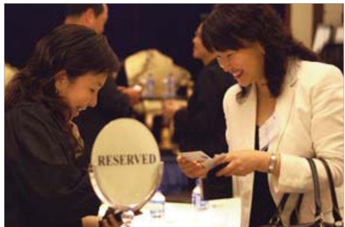
Attendees networking at the conference

For more information on this or other events please contact our event coordinator at service.ap@conference-board.org or (852) 2804 1026.