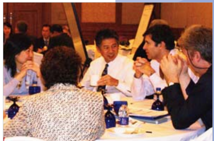
Attendees sharing their ideas during the discussion

For more information on this or other events please contact our event coordinator at service.ap@conference-board.org or (852) 2804 1026.