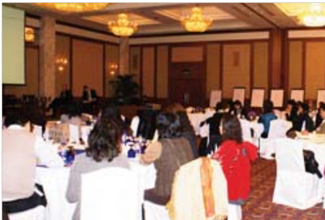
The 2nd Annual China Human Resources Conference in Shanghai

These events from The Conference Board are designed to help human resources professionals strengthen their understanding of key issues, gain insight into what lies ahead, and take away high-quality, actionable intelligence that will benefit their organizations both in the short and long term.